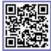
Online Application Direct Link