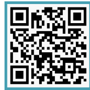
Online Application Manual

(3) Submission of documents: Submit document copy by email and the original documents by post mail